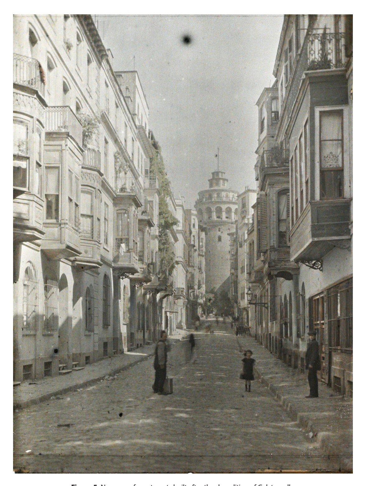
Figure 5. New row of apartments built after the demolition of Galata walls.