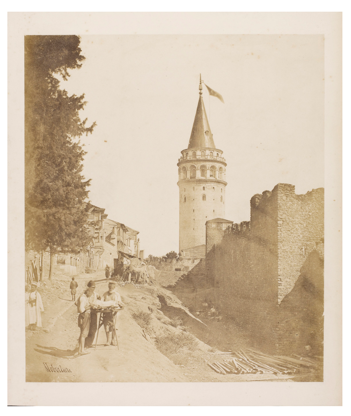
Figure 4. The walls of Galata before the demolition.