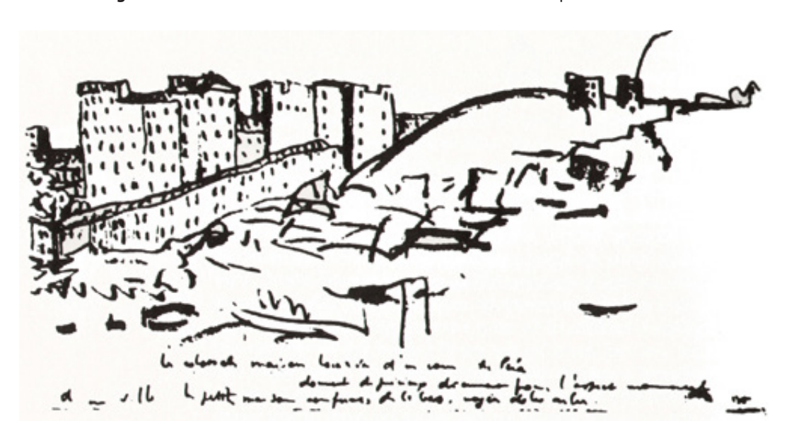
Figure 2. Apartments of Pera from the perspective of young Edouard Jeanneret, Le Corbusier, 1911