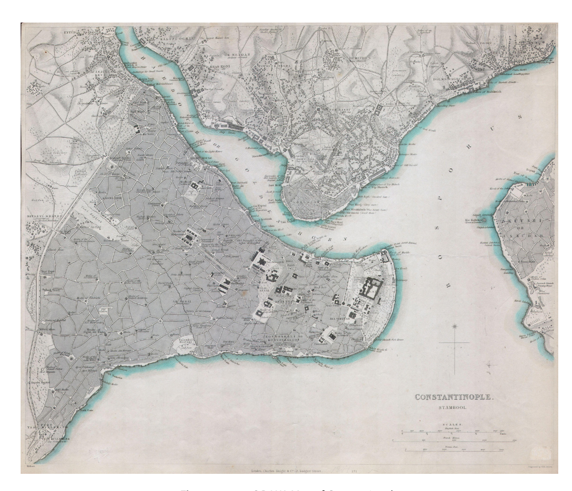
Figure 3. 1840 S.D.U.K. Map of Constantinople