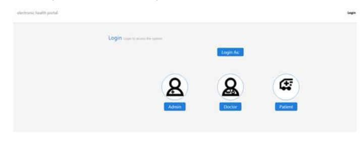
Figure 2. First page of ehp

The user appears in front of three logging options as shown in Figure 2 administrator, doctor, and patient. The interface contains the electronic health portal's name and some details about the institution (such as the name of the institution, private phone numbers, and the location). Access to any of these sections is through a username and password that the portal administrator creates.