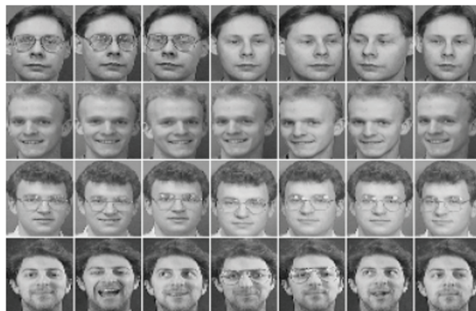
Figure 2. AT&T sample

In our face recognition experiments, we have used the AT&T database (AT&T Laboratories Cambridge). With almost 400 images, we experimented here with 40 people variations. As shown in Figure 2, a preview picture of the Faces database is shown.